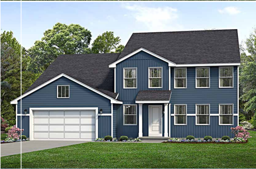
Smart Style Exterior